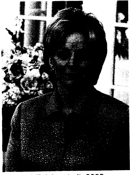
Official portrait, 2005