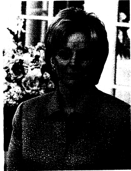
Official portrait, 2005