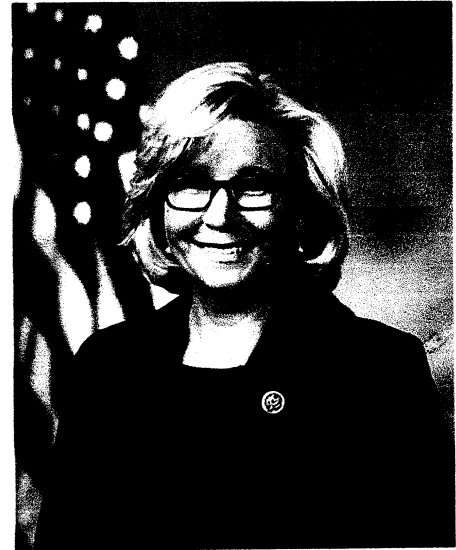
Official portrait, 2018

Member of the U.S. House of Representatives from Wyoming's at-large district